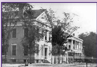
The Cady Home